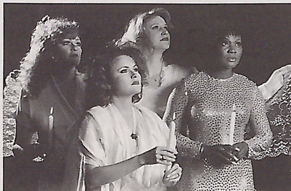
A growing interest in the presence of angels is but one of the contemporary religious themes addressed in the American Cabaret Theatre's production Give Me That New Time Religion .

To receive either publication, contact Denys Pittman at The Polis Center (274-2455).