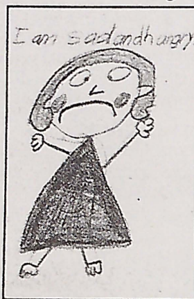
From "Faith and Economic Struggle" video.

During September and October, local congregations of several faiths tested the video and the newspaper. The testing procedure included participants telling their own stories of economic hardship, or of being involved in helping to relieve economic struggle. At completion of testing, participants responded with comments and suggestions about the effectiveness of the materials. They also could develop projects in their own congregations to help with today's economic stress. One goal was to develop a greater sense of community in the city.