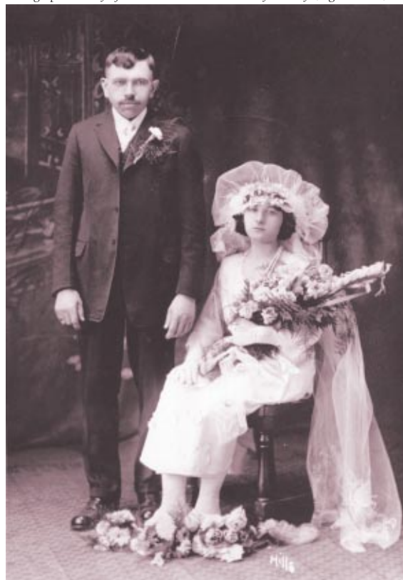
Slovene immigrants, wedding ceremony at Holy Trinity Catholic Church, Haughville neighborhood, ca. 1923.

Photograph courtesy of the Indiana Historical Society Library (neg. # C1785)