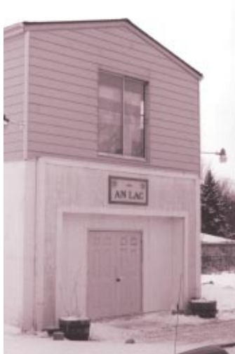
Outside, only the sign indicates this is a place of worship.

In 1965, the U.S. Congress rewrote the nation's immigration laws, resulting in a major increase in immigration from Asia. Locally, Eli Lilly and Company has attracted immigrants from around the world, as has the Indiana University Medical Center, based on the campus of Indiana University Purdue University Indianapolis.