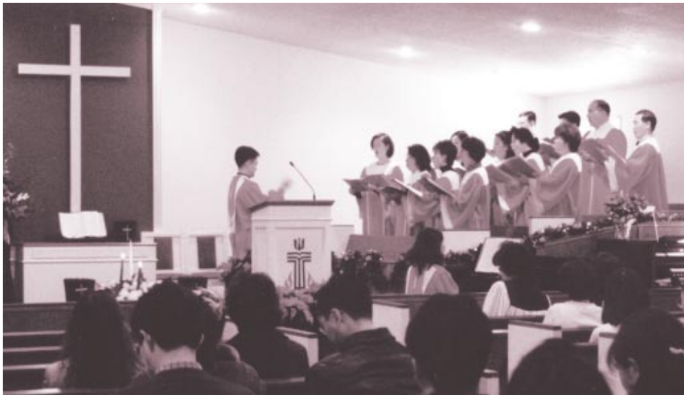
Sunday services, Korean Presbyterian Church of Indianapolis.