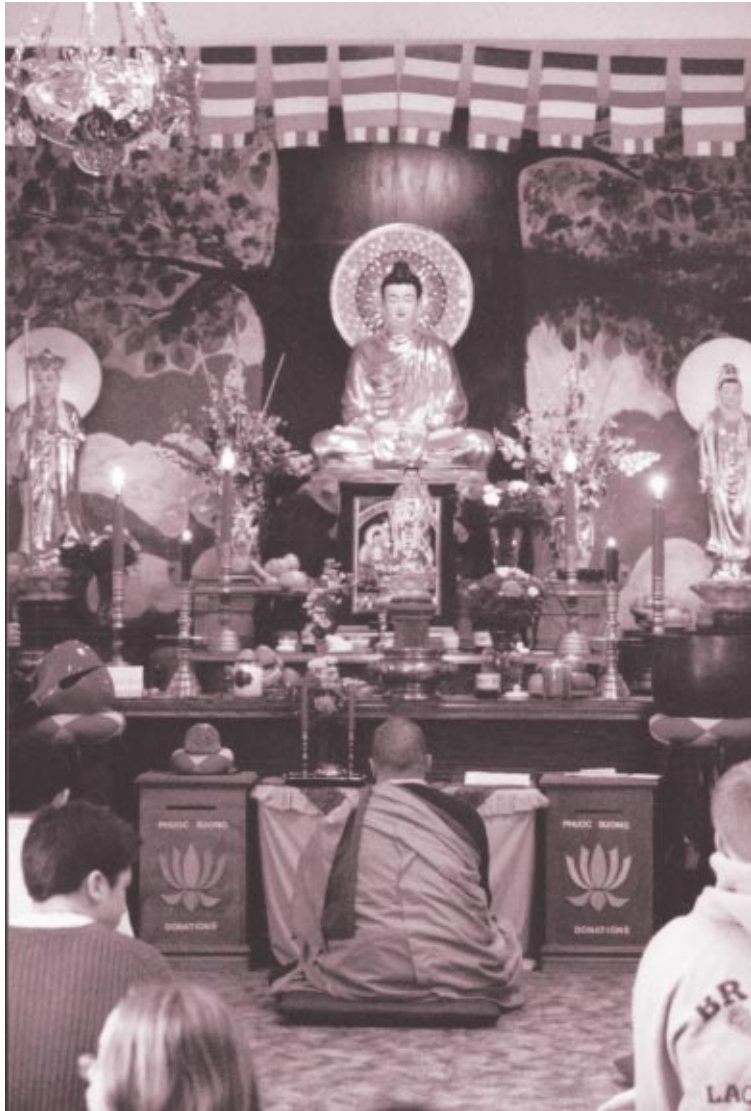
An Lac Temple: the visual richness of Buddhist ceremony.