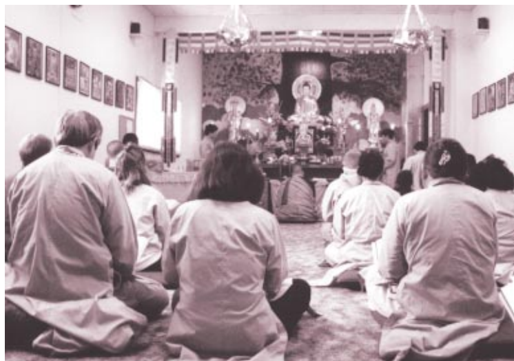
Sunday services, An Lac Buddhist Temple, Indianapolis.

According to a recent Polis Center survey, the Indianapolis area is home to a Buddhist temple, a Baha'i congregation, a Hindu congregation, two Sikh gurdwaras , five Muslim mosques, several Orthodox Christian churches serving various ethnic groups, and about a dozen Korean Christian congregations, ranging in denomination from Catholic to Southern Baptist. The largest group of recent immigrants, Hispanics, are represented by numerous churches. (See the Fall 1998 issue of Religion & Community .)