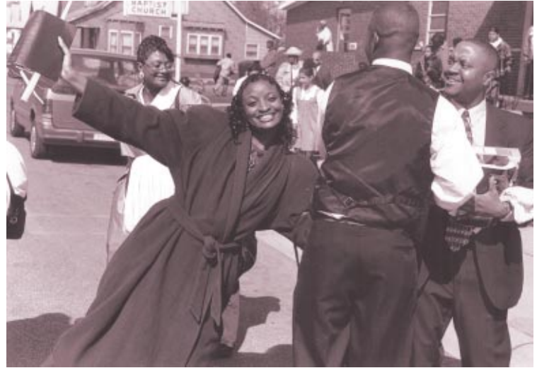
Fundamentalist, Evangelical, and Pentecostal congregations have traditionally “grown their own” clergy.

“Vineyard is a church planting movement,” he notes. “Eventually, I will be looking to train someone.”