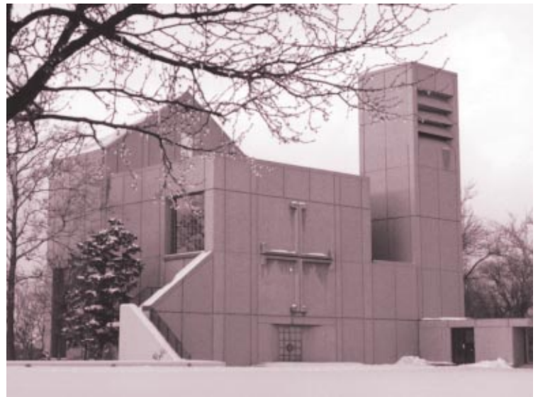
Chapel, Christian Theological Seminary.

Heritage Baptist University in Greenwood is an Independent Baptist Bible college, established in 1955. In addition to undergraduate degrees in Biblical studies, pastoral studies, mission, education and sacred music, it offers the Master of Divinity