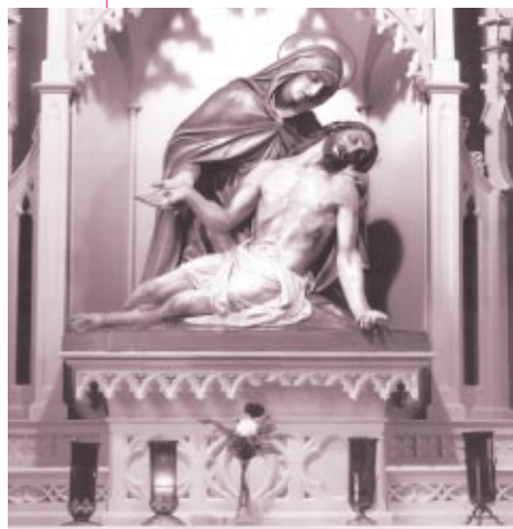
Catholic and mainline denominations have emphasized formal academic training for clergy.