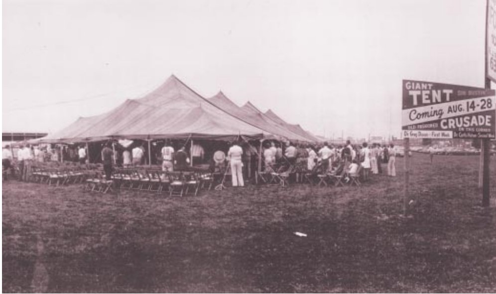
Revival Meeting, Indianapolis.